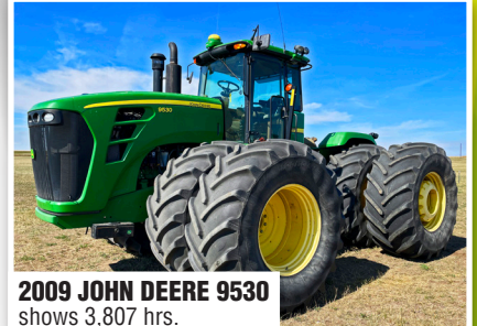
2009 JOHN DEERE 9530 shows 3,807 hrs.