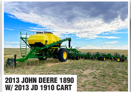
2013 JOHN DEERE 1890 W/ 2013 JD 1910 CART