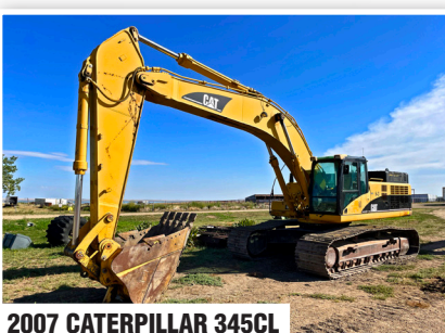
2007 CATERPILLAR 345CL

*Lunch will be served on-site on auction day*