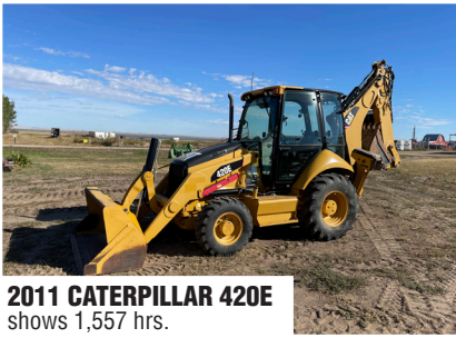
2011 CATERPILLAR 420E shows 1,557 hrs.