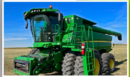
2013 JOHN DEERE S690 STS shows 1,657 sep. hrs; shows 2,273 engine hrs.