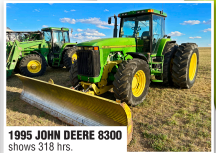
1995 JOHN DEERE 8300 shows 318 hrs.