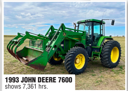
1993 JOHN DEERE 7600 shows 7,361 hrs.