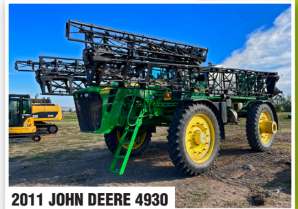
2011 JOHN DEERE 4930