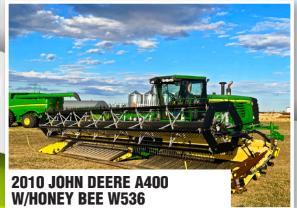
2010 JOHN DEERE A400 W/HONEY BEE W536