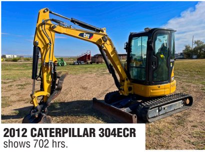
2012 CATERPILLAR 304ECR shows 702 hrs.